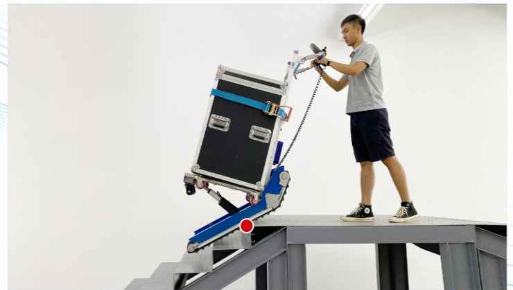
Must do for the last step upward: Climb to the balance point where you can press down the machine to the upper platform easily and stop, continue after the loading board complete the automatic adjusting.