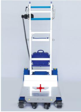
Set the goods' gravity center to the center of the loading board.