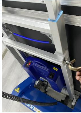
Fasten the goods with straps.