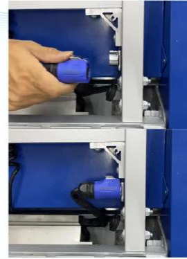
Insert the plug under the battery base before the first use. No need to remove it then.