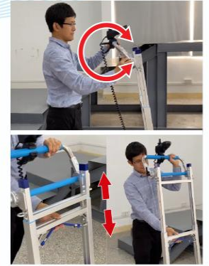
Adjust the L-type handle and back panel to the suitable position.

Please watch the operation video before use, and practice without load.