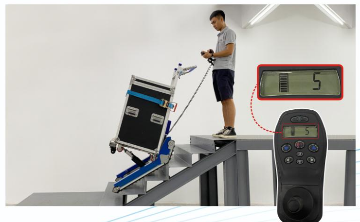
With manually adjusting mode, must carefully keep balance by adjusting the cargo's gravity center.